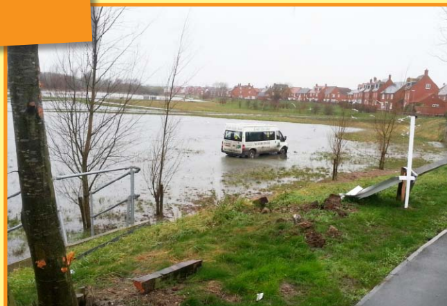
Water taxi: Chaos caused by the floods

This is the bridge over the River Thames at the southern boundary of Buckingham Park over which the main A413 runs. In light of the recent severe rainstorms and prolonged flooding, your Parish Council raised concerns about possible damage with Bucks County Council. Our County Councillor (Netta Glover) confirmed that BCC reviewed the most recent inspection of the bridge which was undertaken last May. That report concluded that whilst a few minor repairs were required, no defects were noted that indicated any concern with the overall stability of the bridge. However, in light of most recent events, BCC will ask an inspector to visit the bridge shortly to check that recent high water levels have not had any damaging effects on